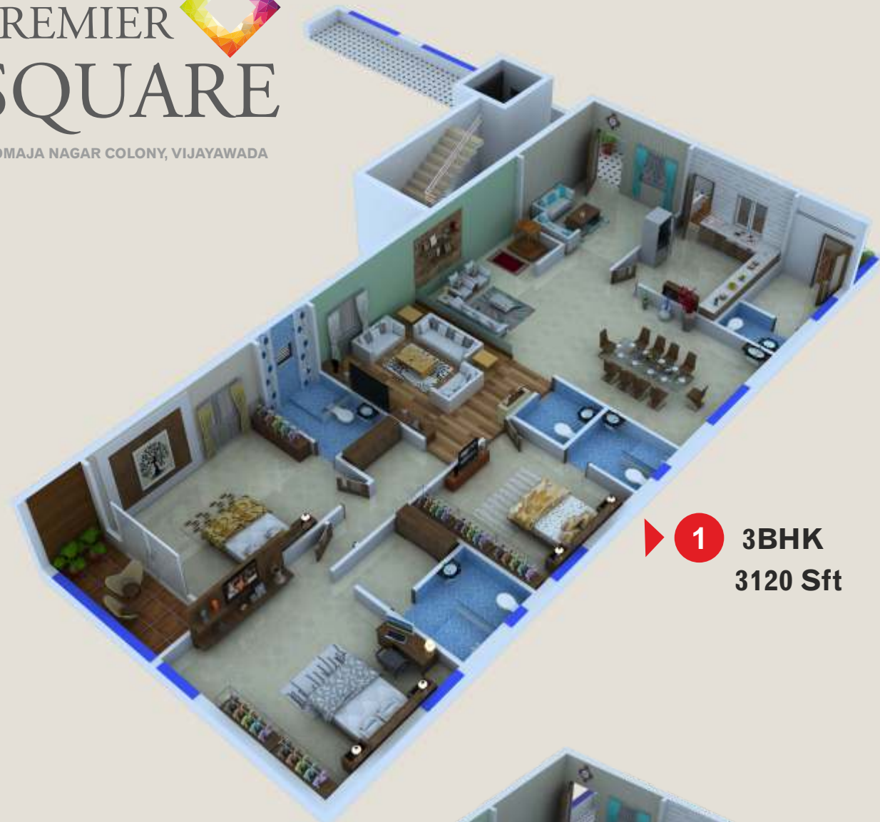
▶ 1 3BHK 3120 Sft