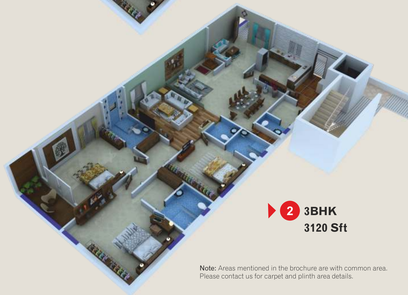
▶ 2 3BHK 3120 Sft

Note: Areas mentioned in the brochure are with common area. Please contact us for carpet and plinth area details.